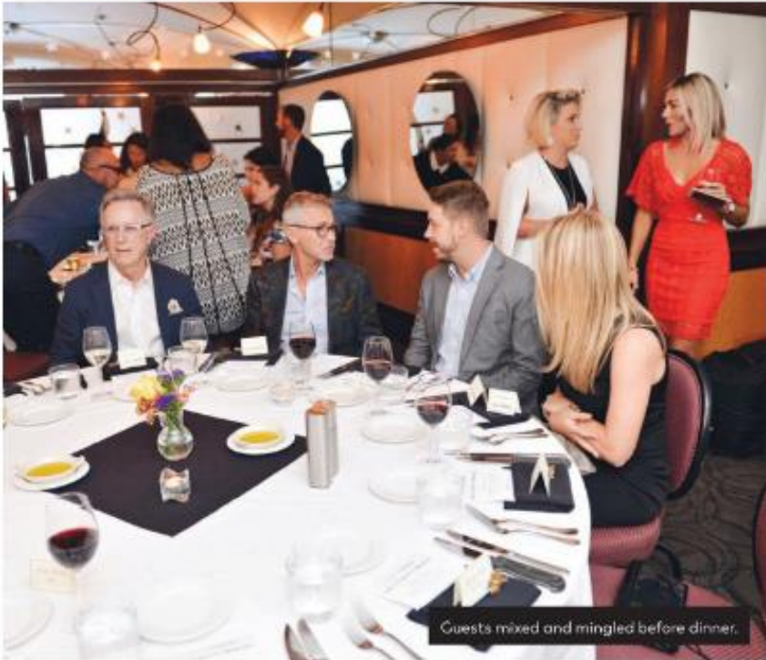
Guests mixed and mingled before dinner.

modern luxury interiors atlanta and adac dinner