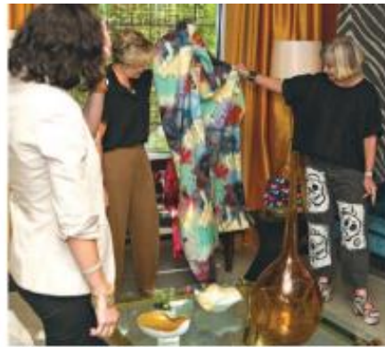
Jim Thompson Showroom