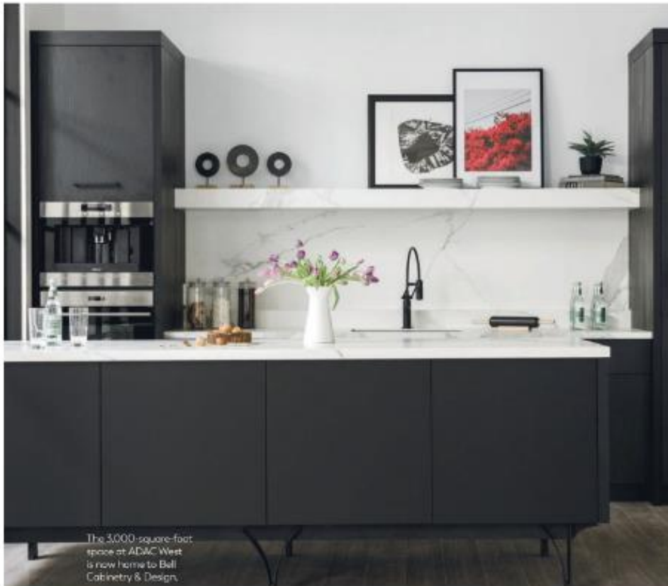
The 3,000-square-foot space at ADAC West is now home to Bell Cabinetry & Design.