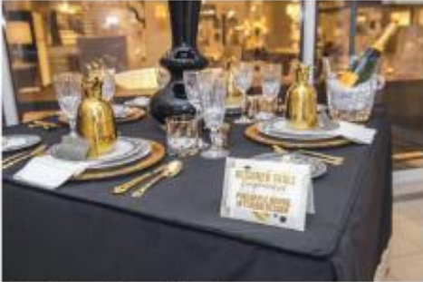
Designer Tablescape by Pineapple House Interiors