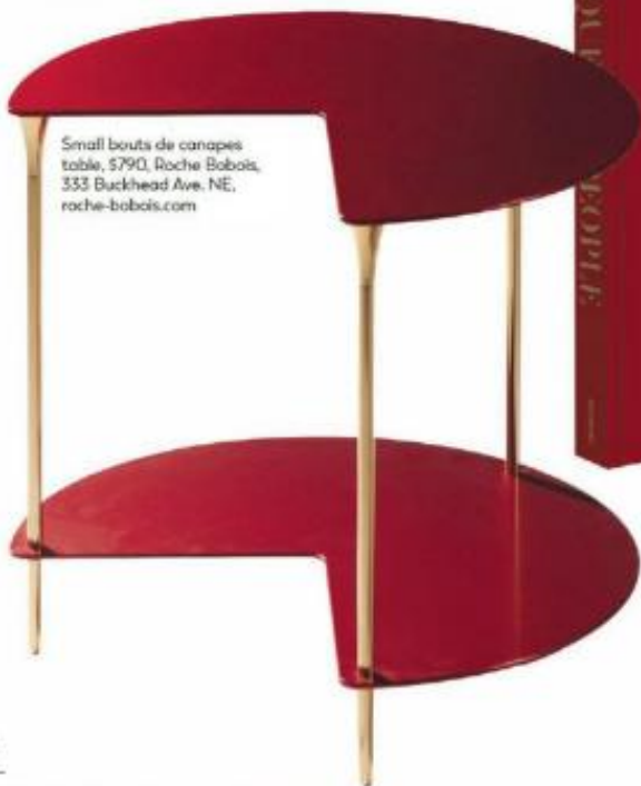
Small bouts de canapes table, $790, Roche Bobois, 333 Buckhead Ave. NE, roche-bobois.com