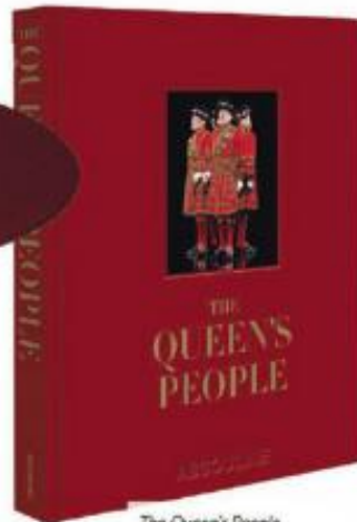
The Queen's People, $845, by Assouline at Bungalow Classic, 1197 Howell Mill Road, bungalowclassic.com; assouline.com