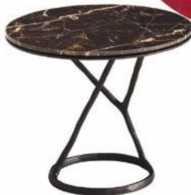
Iida side tables, price upon request, by Jean-Marie Moussaud for Poliform at Switch Modern, 670 14th St. NW, switchmodern.com ; poliformusa.com