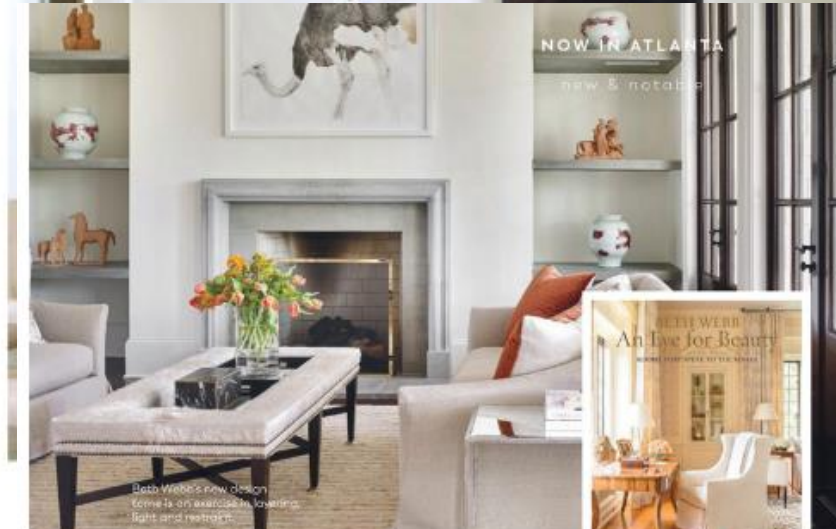
Beth Webb's new design Kenya is an exquisite, low-key, light and neutral.