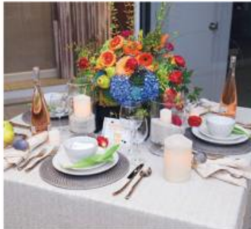
Designer Tablescapes by FDI