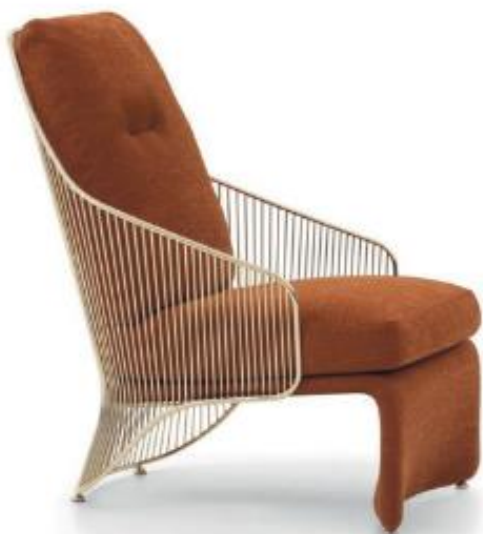
HA Modern featuring Minotti Colette Chair Designed by Rodolfo Dordoni

This armchair takes its inspiration from the iconic period of mid-century elegance and skillfully blends experimentation in the design of shapes with sophisticated decorative taste. Available in 2 sizes and 2 finishes: light gold and black nickel. Located at suite 413, HAModern.com , info@HAModern.com , 678.732.9732.