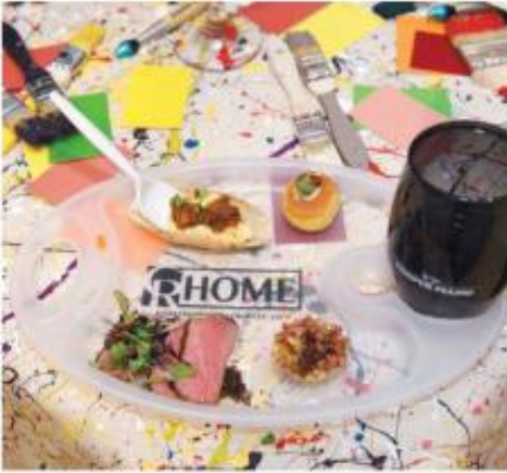
Serving Tray compliments of CR Home