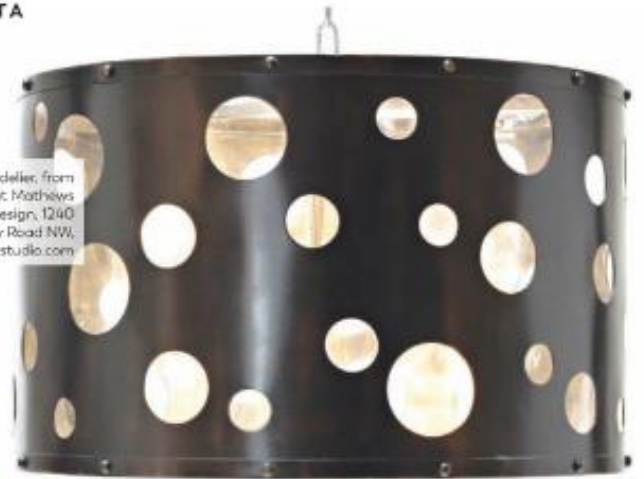
Dottie chandelier, from $2,200, by Ciy of Mathews Furniture + Design, 1240 W. Paces Ferry Road NW, oystudio.com