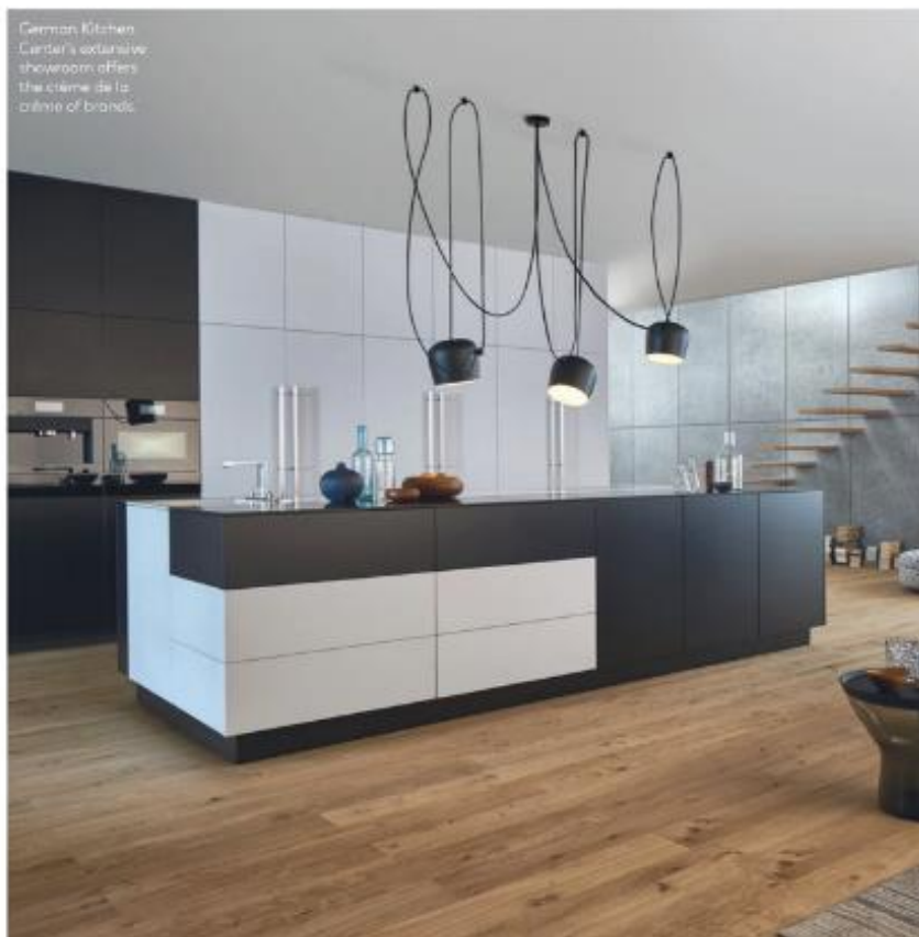
German Kitchen Center’s extensive showroom offers the client a variety of brands.