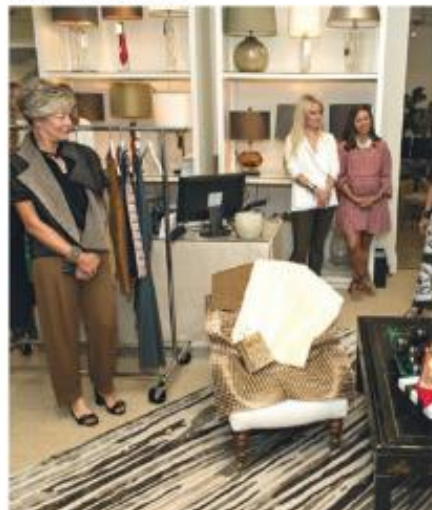
Travis & Company Showroom