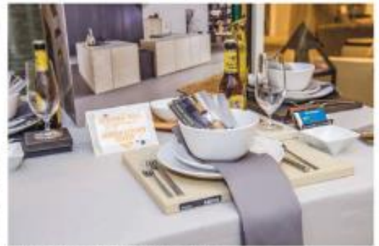
Designer Tablescapes by German Kitchen Center