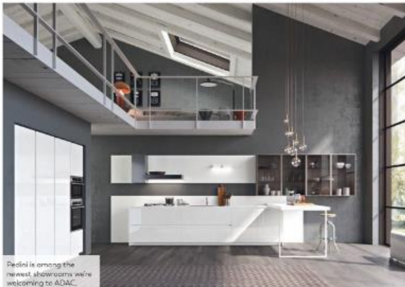
Pedini is among the newest showrooms we're welcoming to ADAC.