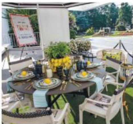
Entrance Vignette by C. Socci Inc.