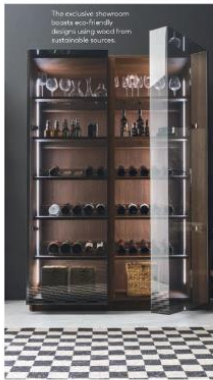
The exclusive showroom boasts eco-friendly designs using wood from sustainable sources.