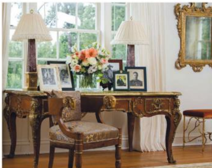
A rare Louis XIV antique writing desk is one of the many marvels of Pleasant Hill, our cover star.

Instagram: @mlinteriorsatl, @laurenfinney