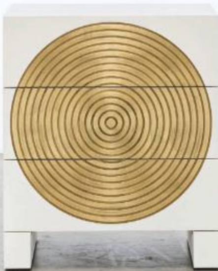
Halo dresser, from $6,240, shinebysha.com