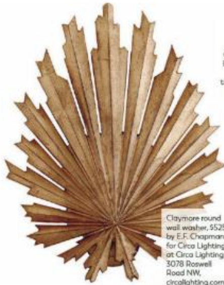
Claymore round wall washer, $525, by E.F. Chapman for Circa Lighting at Circa Lighting, 3078 Roswell Road NW, circalighting.com