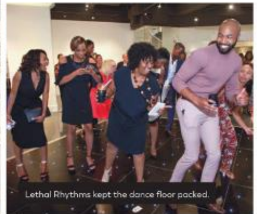
Lethal Rhythms kept the dance floor packed.