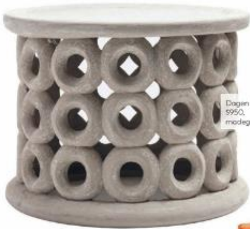
Dagon side table, $950, madegoods.com