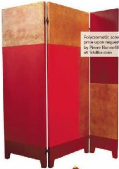
Polychromatic screen, price upon request, by Pierre Bonafille at 1stdibs.com