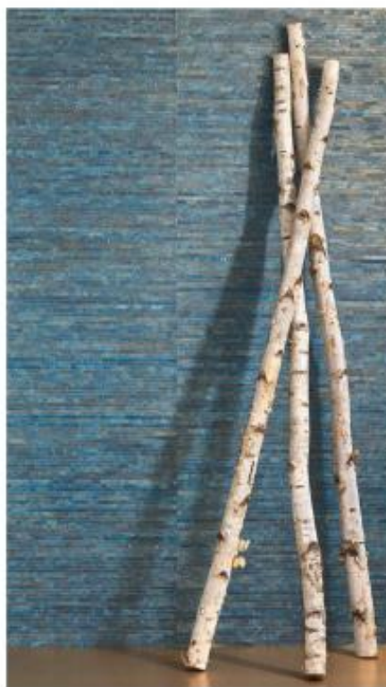
Innovations featuring Botanica

This armchair takes its inspiration from the iconic period of mid-century elegance and skillfully blends experimentation in the design of shapes with sophisticated decorative taste. Available in 2 sizes and 2 finishes: light gold and black nickel. Located at suite 413, HAModern.com , info@HAModern.com , 678.732.9732.