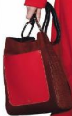
Lipstick Red coat, $4,995, and Chianti Julia tote, $1,395, both by Jason Wu at Saks Fifth Avenue, Phipps Plaza, jasonwustudio.com; shoes, price upon request, by Jason Wu for Manolo Blahnik, similar styles at manoloblahnik.com.