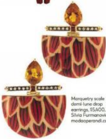
Marquetry scale demi-lune drop earrings, $5,400, by Silvia Furmanovich at modaoperandi.com