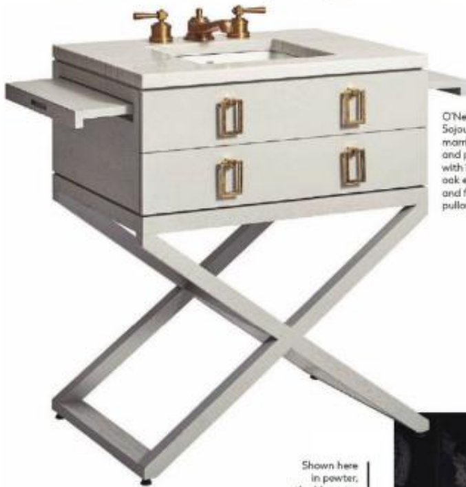
O'Neil Ruppel's Sojourn vanity marries luxury and practicality with its classy oak exterior and functional pullout trays.

The days of one-size-fits-all furnishings are, of course, long gone, but O'Neil Ruppel is challenging any current limits of customization with its new line of customizable vanities. The O'Neil Ruppel brand itself—a private in-house label from Renaissance Tile & Bath—was actually born out of the desire to provide more personalized products for the bathroom than the traditional retail market offers. After all, such an intimate space deserves the most distinguishing details. $2,995-$4,295 (not including top, bowl or faucet), 349 Peachtree Hills Ave. NE, renaissancetileandbath.com ; oneilruppel.com —Jaime Lin Weinstein